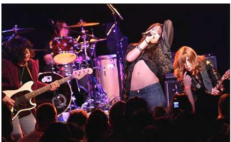
Lez Zeppelin, an all-female Led Zeppelin tribute band, will perform at the Middle East.