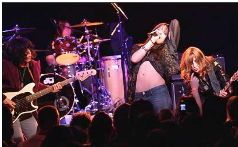
Lez Zeppelin, an all-female Led Zeppelin tribute band, will perform at the Middle East.