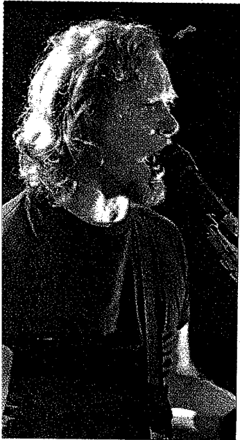
Metallica's James Hetfield

Pearl Jam, Metallica, Plant and Krauss highlight 'most diverse lineup ever'