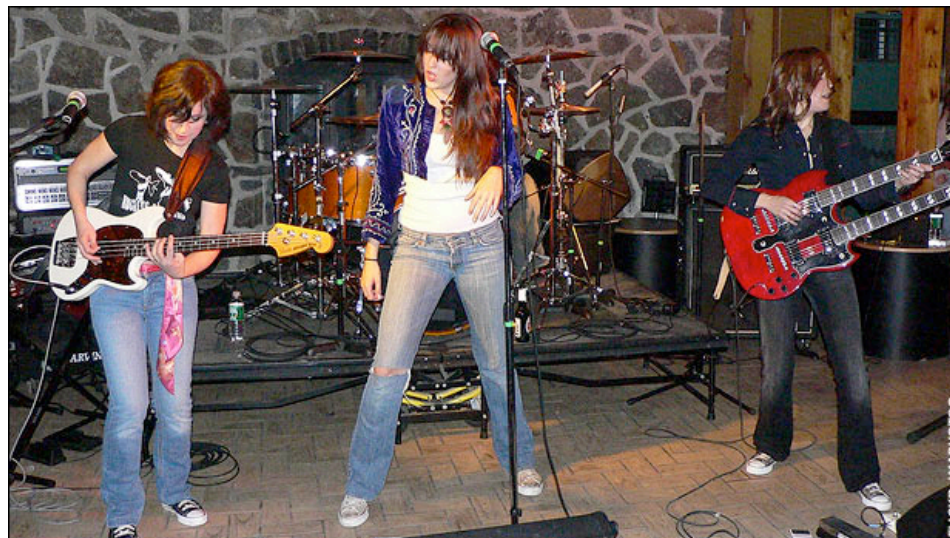
Lez Zeppelin, not to be confused with Led Zeppelin

Newswires were quick to jump on the line-up announcement for the 2008 Bonnaroo Arts and Music Festival, with the Associated Press and Press Association foreign wires announcing that Led Zeppelin had signed to a long-rumoured appearance at the US extravaganza.